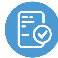
New Term Submissions